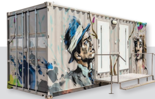
VIP Ablution Block