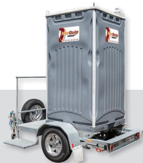
Trailer Mounted Toilets