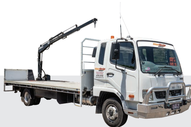
Fuso Crane Truck

Our fleet of trucks include this handy 6m flat bed with rear mounted crane. This truck, when combined with delivery trailer, can carry 20 portable toilets at one time or a combination of toilets and temporary fencing.