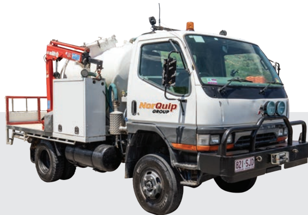
Canter Service Vehicle

With our 4x4 Canter Vacuum Truck, we are able to service and deliver to remote or difficult to access areas. This truck is designed to carry out complete portable toilet servicing, from waste removal, water and consumable restock and complete sanitised clean. This truck is fitted with a loading crane and is designed to carry two toilets, it is also stocked with portaloos parts to handle any repairs on the go.