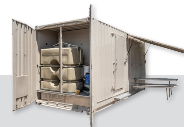
Containerised Site Solution