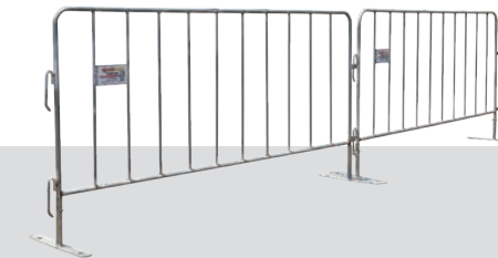
Crowd Control Barrier