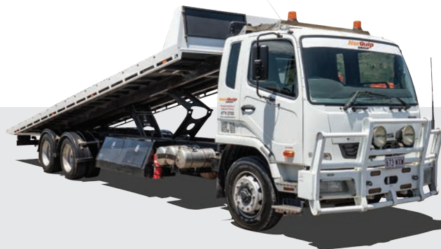
Fuso Tilt Truck

Our Fuso Tilt Truck is the perfect work horse, with a long tray and large carry capacity there are not many limitations. This allows us to handle every aspect of transportable building hire. We have the ability to advise our customers when equipment will arrive on site. We can also deliver up to 500m of temporary fencing on one load and carry our own forklift to get the job done fast.