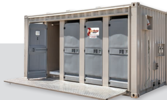
8 Head Shower Block