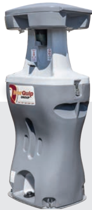
Hand Wash Stations Two Person

Provides an upright hand wash solution with liquid soap, water and paper towel so your guests can be assured they have washed properly.