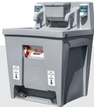
Hand Wash Stations Super Twin

Great for events where food is available or to encourage patrons to vacate the amenities faster. Our hands-free hand wash stations are operated easily using the foot pump.