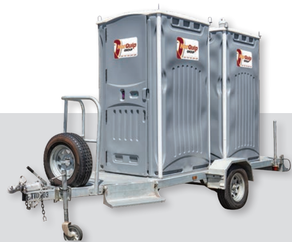
Trailer Mounted Showers