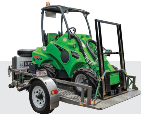
Avant 523 Forklift

Our versatile 4WD Avant Loader has excellent rough terrain capabilities and with its compact dimensions the Avant can work in tight situations in order to meet all event setup requirements. Being articulated, gives this machine the ability to deliver on sensitive surfaces.