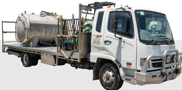
Fuso Forklift Delivery Vehicle

With our Fuso Vacuum Truck, we are able to service and deliver toilets and temporary fencing. This truck is designed to carry out complete portable toilet servicing, from waste removal, water and consumable replenishing and a complete sanitised clean. This truck carries a mini articulated forklift enabling easy placement of portable toilets and temporary fencing.