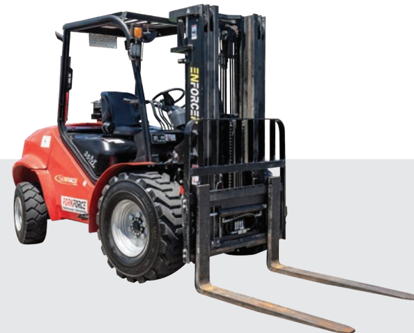
Enforcer All-Terrain Forklift

Our 3.5t All-Terrain Forklift is perfect for those rough sites or heavy lifts. Ready to help get your event set-up or assist on your work site long term.