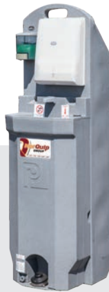
Hand Wash Stations On Wheels

An alternative hand wash solution that also provides soap, water and paper towel but with added mobility.