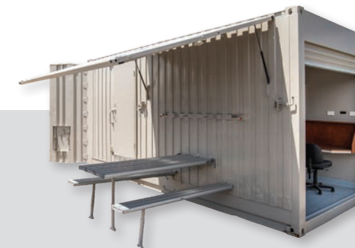
Containerised Site Solution