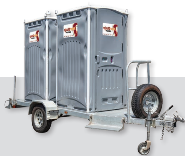
Trailer Mounted Toilets